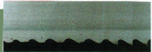
Continuous Chipping that occurs with the conventional blade is eliminated